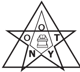
Onistagrawa Triangle #215